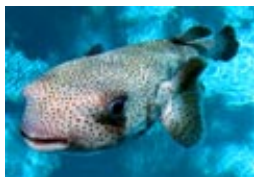
The Fugu - a libido stimulate for the Japanese?

For some reason – and I’m sure this hasn’t gone unnoticed by psychologists – many aphrodisiacs are derived from creatures that are inherently dangerous. The Japanese, for example, believe the flesh near the poisonous liver of the fugu, a deadly blowfish, stimulates the libido. The Chinese, and most cultures in Southeast Asia including the Thais – have a thing about poisonous snakes and some of the world’s dangerous, but endangered species.