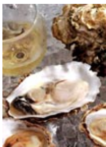
Wine and oysters - ease into a romantic evening

Other foodstuffs considered aphrodisiacs by Thais are almost too numerous to mention. Like Westerners some Thais swear by raw oysters, but I don't really subscribe to this view. They are low in fat and contain numerous minerals, including phosphorous, iodine and zinc. But countless research projects have failed to show that they make anyone horny. Garlic is championed by many, but even if it did work, its use is probably counterproductive. Who wants to get near someone reeking of garlic?