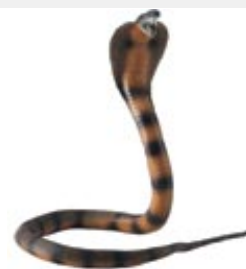
The blood of a cobra - the supreme aphrodisiac

As with virtually all foods, a fresh product is considered best. If you feel your sexual batteries need charging, a shot of cobra blood may be what the doctor ordered. If you choose this aperitif be forewarned: unscrupulous proprietors have been known to substitute other substances for snake blood. It is probably best insisting the blood be extracted while you watch. This can be done at Klong Toey market on the corner of Ratchada and Rama IV. An enterprising proprietor will let you observe as he extracts the blood for your drink. Some people simply gulp down a shot of the stuff, but this is a bit crass. A more civilized practice is to drink blood that has been mixed with alcohol – sort of a Bloody Mary made with real blood.