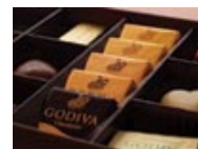
Fancy chocolates - a gift to inspire romance

This isn't to say the Thais don't recognize the value of a romantic evening with red roses and a little libation as a means of loosening the inhibitions and weakening the ramparts. Indeed, Thai nightclubs and other drinking establishments have their fair share of wily pursuers stalking their prey with alcoholic beverages. Perhaps this is the